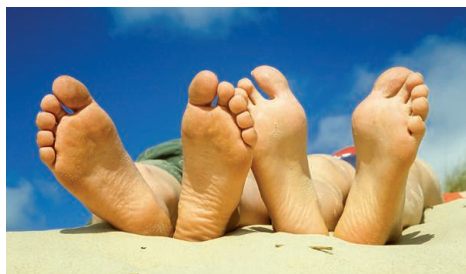
DNA damage can continue after sun exposure has ended

of antimicrobial factors. T cells do this by switching from mitochondrial to glycolytic metabolism, but what happens when nutrients are scarce, such as in infected tissues or tumors? Blagih et al. examined this question by starving